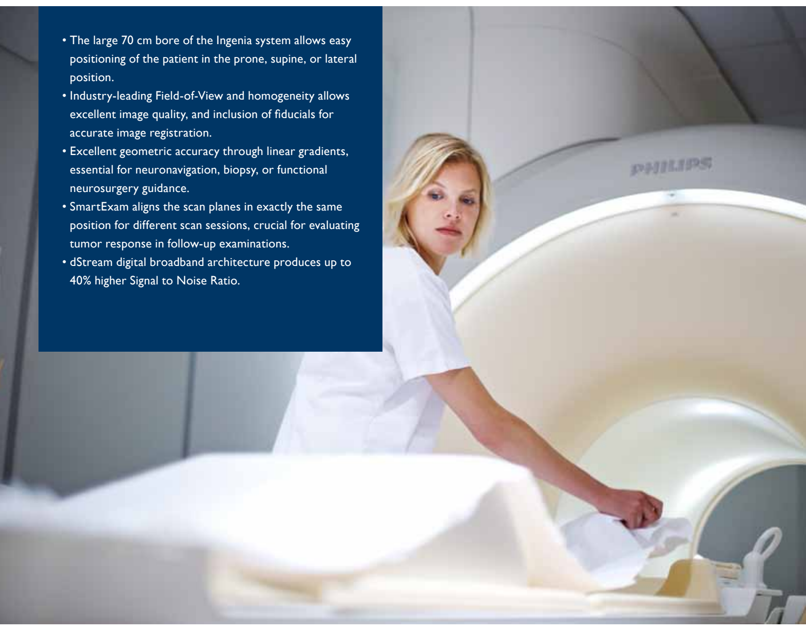
The 70 cm bore and the large Field-of-View enable the patient to be positioned prone, supine and lateral in the head frame.