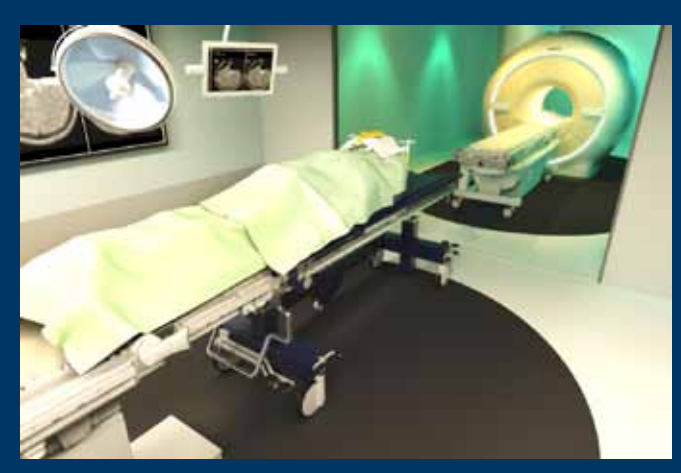
Patient can be quickly and smoothly transferred between OR and MR