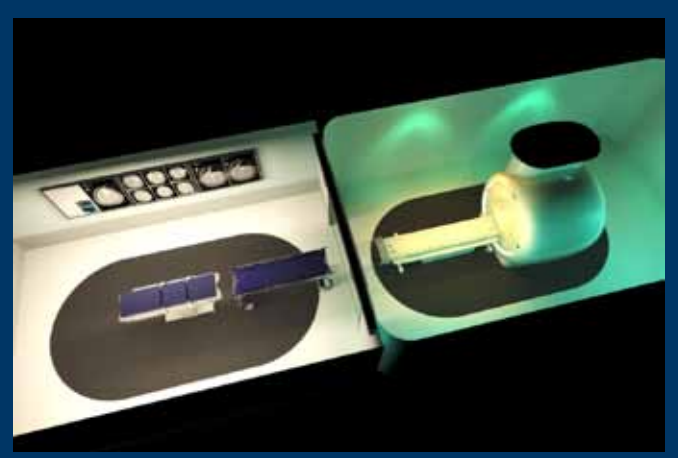
Dual-room layout (MR-OR) with high-end intra-operative Ingenia MR and sterile OR. MR and OR can be used together or stand-alone for efficient usage.

In addition to standard front docking, the Philips MR-OR solution also features a rear-docking capability. That means you can connect not just one, but two or more ORs to the MR room to increase utilization of your equipment. Each room is a separate entity that can be