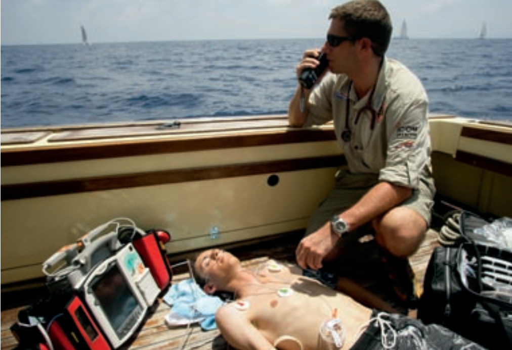
The HeartStart MRx provides the defibrillation and monitoring necessary to care for a patient until they can be transferred to the local medical services

than 12 minutes. With the doctors taking over soon after, they resuscitated the skipper in record time and, although he was seriously injured, he could be saved and transferred to hospital by helicopter. The entire rescue lasted no more than 40 minutes, despite taking place at sea, on a boat buffeted by waves under extremely wet conditions, while the race continued!