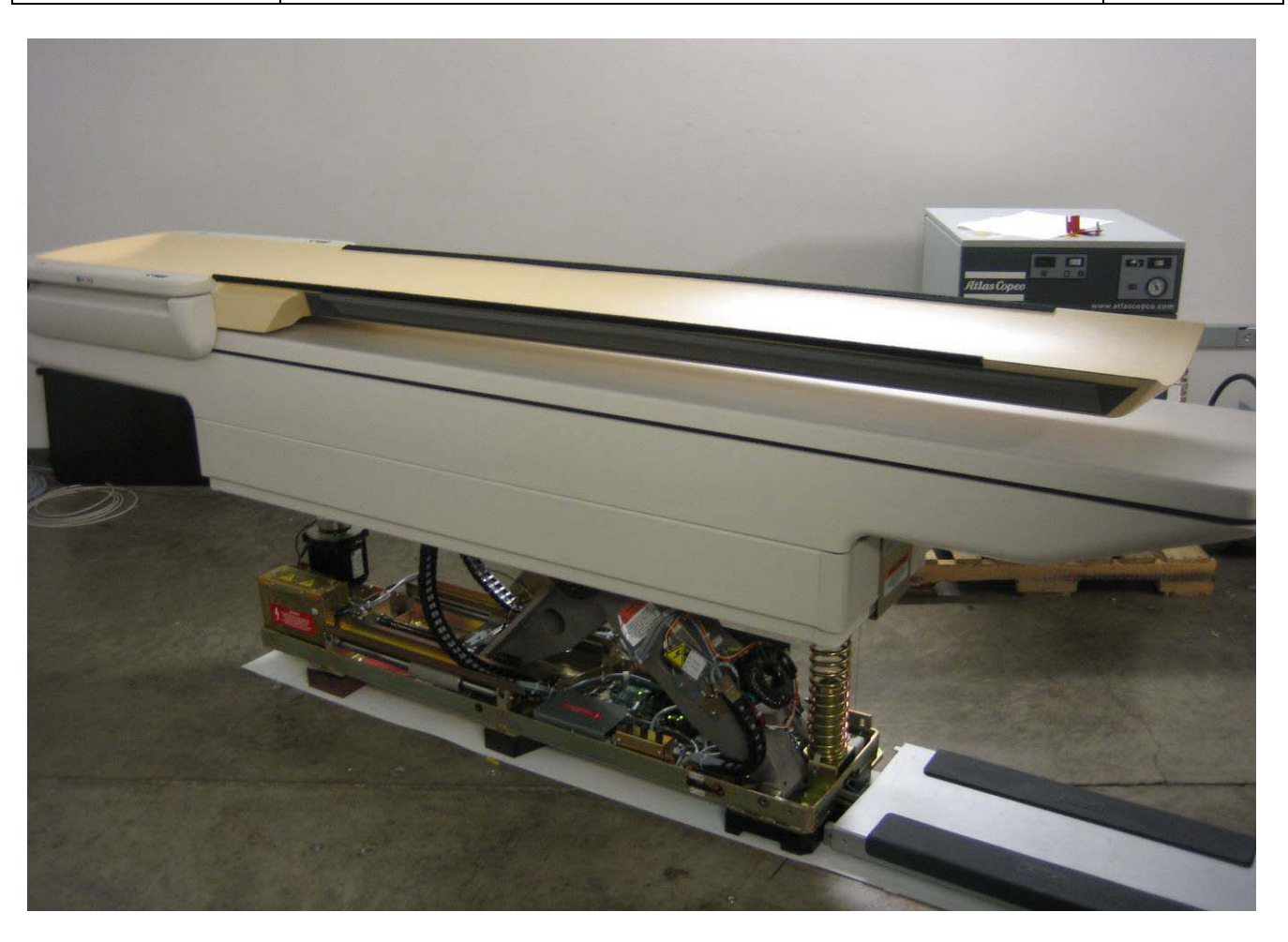
Figure 3: Full view of Patient Support

PHILIPS Product Recycling Passport Page 4 of 5 HEALTHCARE