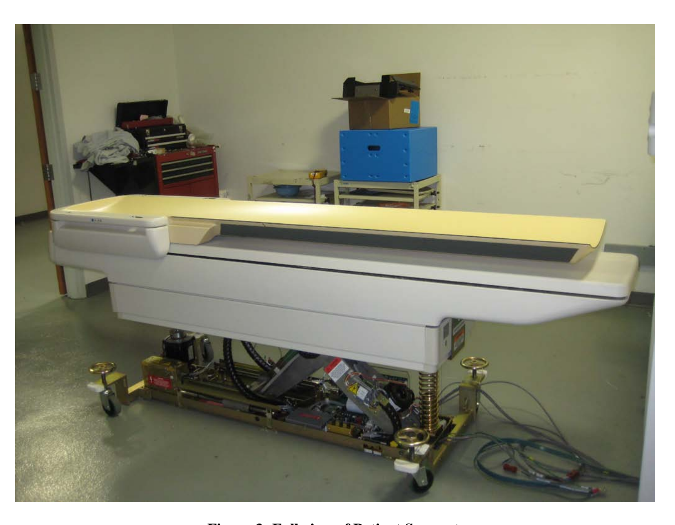
Figure 3: Full view of Patient Support

PHILIPS HEALTHCARE Product Recycling Passport Page 4 of 5