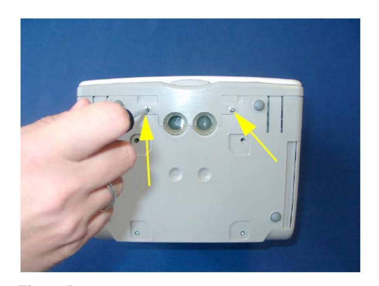
Figure 55 Remove the two screws securing the quick mount cover.

4 Unscrew the two screws inside the internal recorder and pull out the recorder. Note that these screws will not come out completely but remain in the recorder housing.