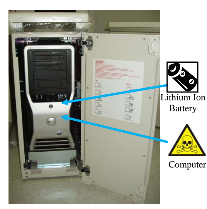
Figure 1, PET/CT Host Front

PHILIPS MEDICAL SYSTEMS Page 2 of 3 2009 July