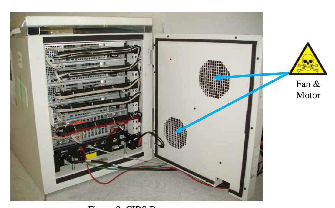
Figure 2, CIRS Rear

Title: <u>TFBB CIRS Recycling Passport</u> Recycling Passport Number: <u>DMR104552</u> Rev: <u>01</u>