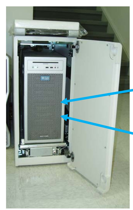
Figure 1, PRS Front

PHILIPS Page 2 of 3 2009 July MEDICAL SYSTEMS