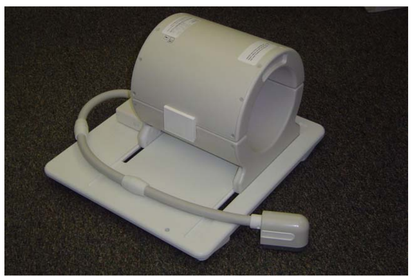
Figure 1 7T Invivo Quadrature Extremity coil – top and bottom connected.