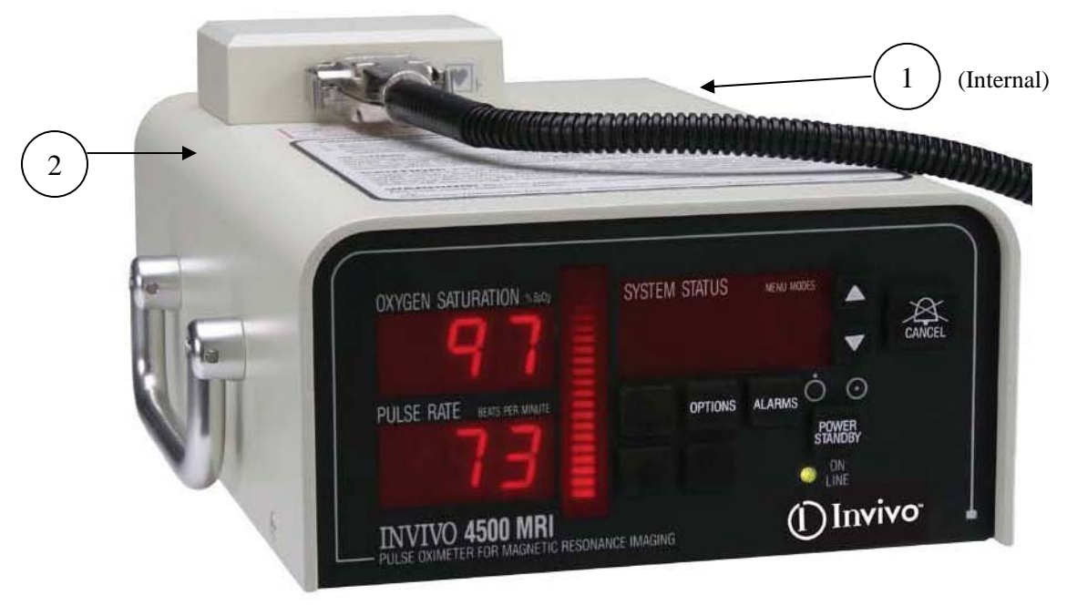
Figure 1: 4500MRI Pulse Oximeter, Models 3109-1 & 3109-3