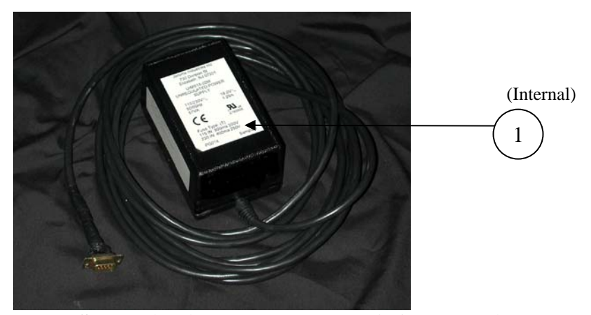
Figure 4: Power Supply (Invivo Part No. HE153A & HE153B)