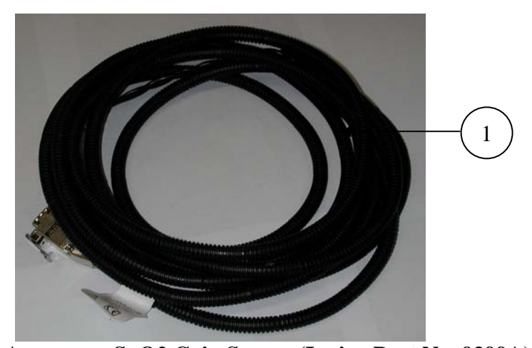
Figure 5: Accessory, SpO2 Grip Sensor (Invivo Part No. 9399A)