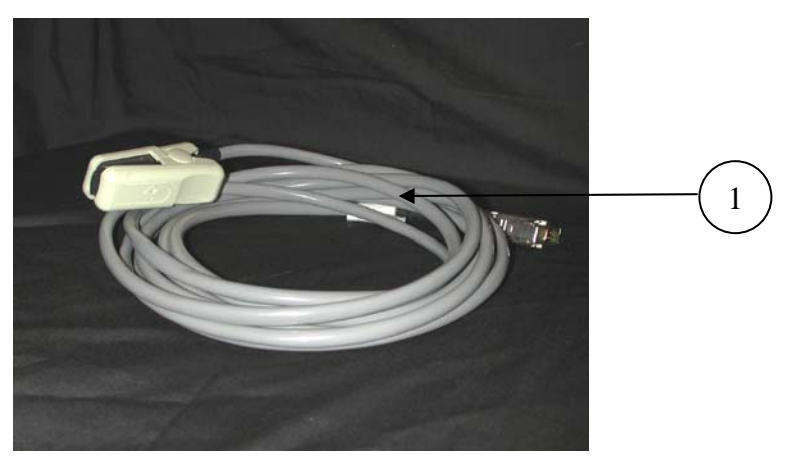
Figure 6: Accessory, Oxiclip MRI Finger Sensor (Invivo Part No. 9367)