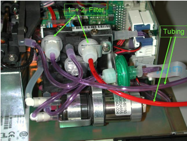
Figure 2 Figure 3