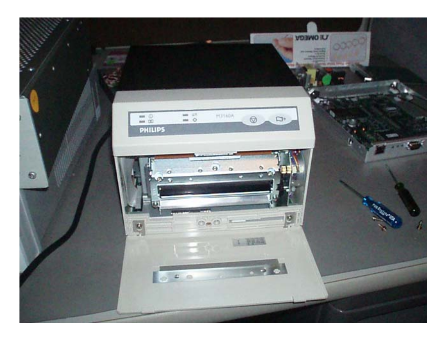
Figure 2 (Open front panel)

Title: M3160A 4-Channel Thermal Recorder Recycling Passport