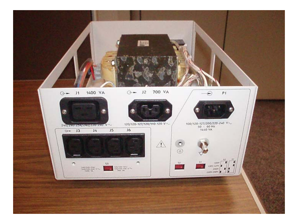
Figure 1 (picture of unit with cover off – removed with Phillips Screwdriver)