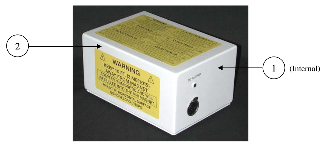
Figure 3: Power Supply (Invivo Part no. AS201)