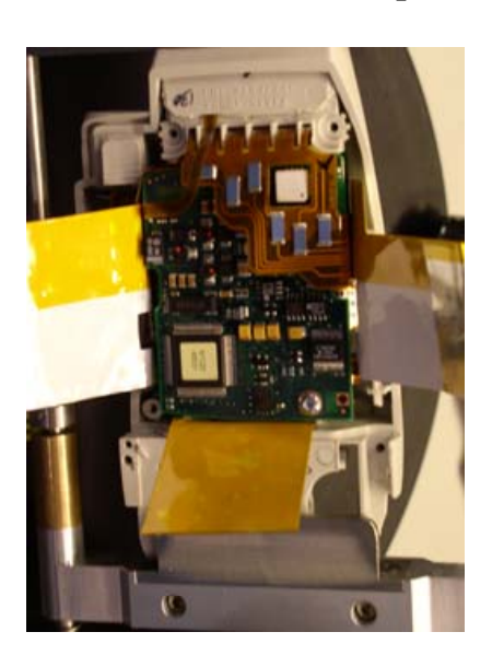
Figure 1. Sensor PC Board (optional)