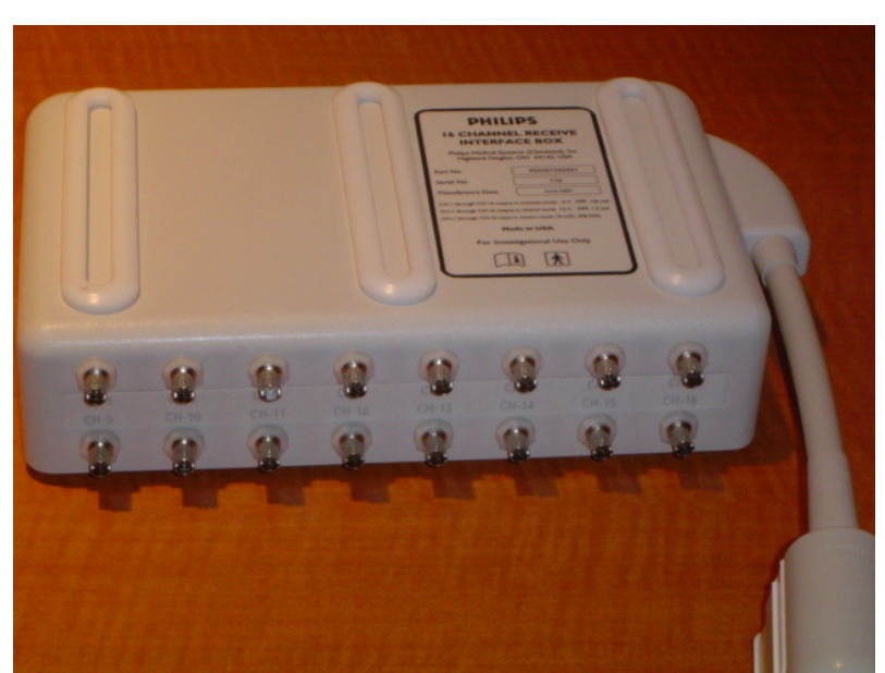
Figure 1. 7T Achieva 16 Channel Interface box.