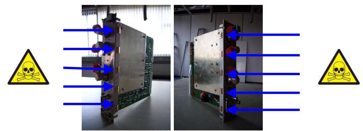
Figure 2, Berylium Sticky-Fingers on Printed circuit board assembly