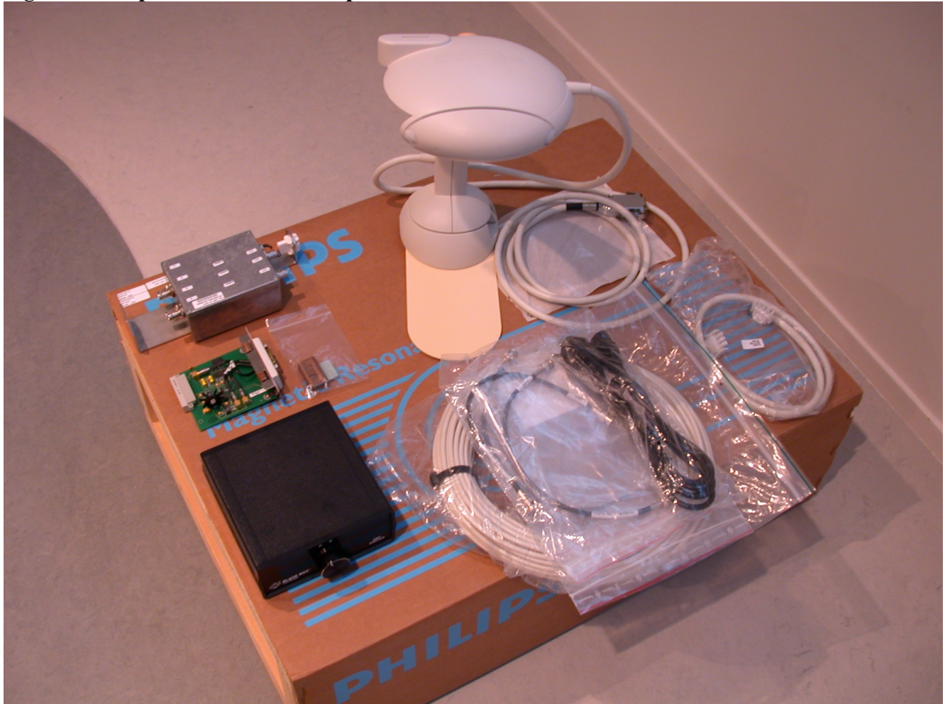
Figure 1: complete Comfort Zone option