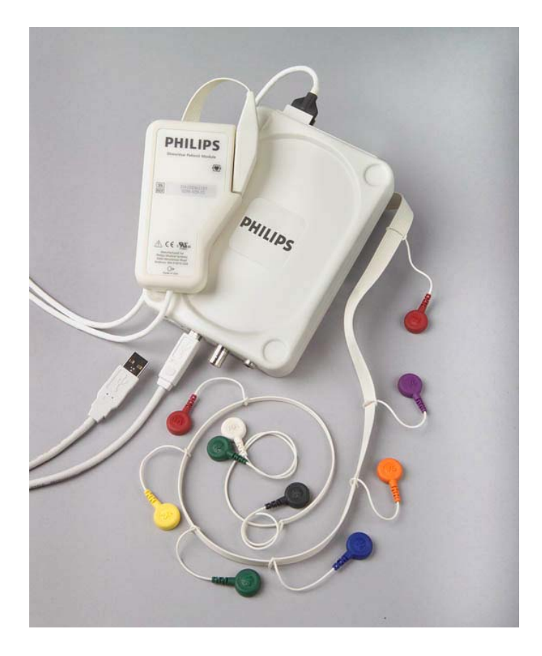
Direct Wired ECG Module with USB Connector: No battery included