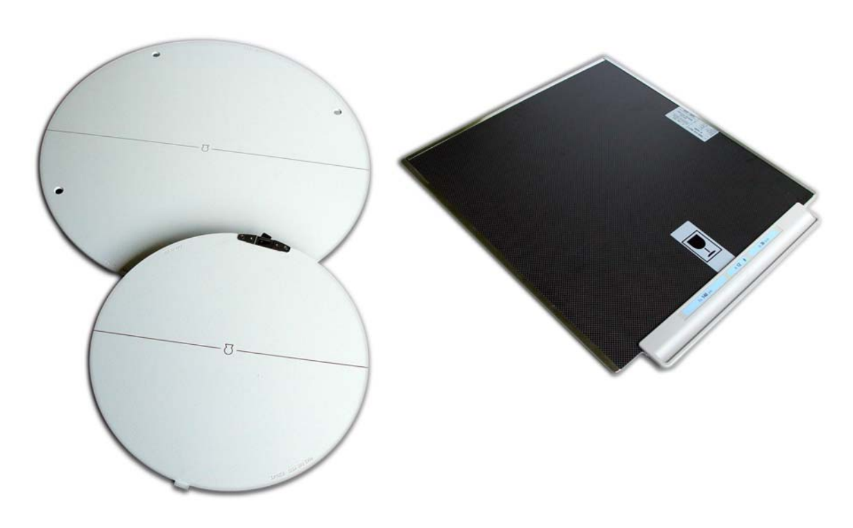
Throughout of grid