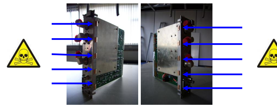
Figure 2, Berylium Sticky-Fingers on Printed circuit board assembly

Note: Figures comprehends the none MN option