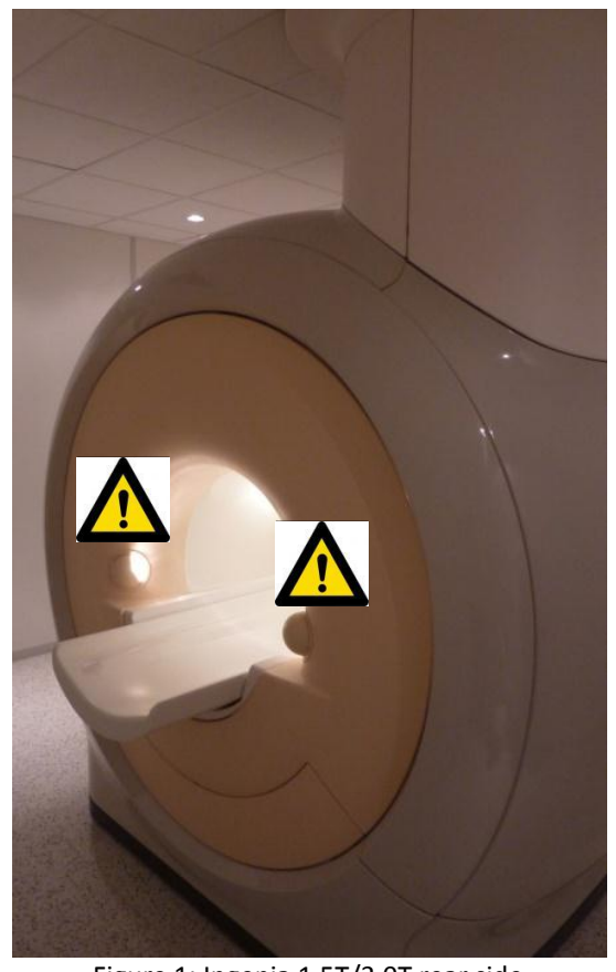
Figure 1: Ingenia 1.5T/3.0T rear side