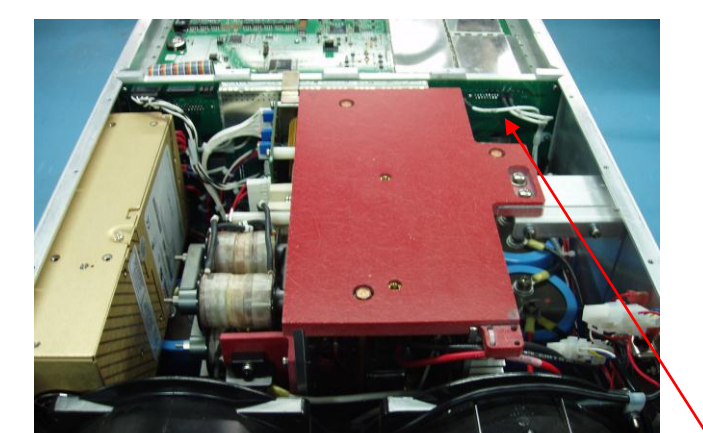
Figure 3 Rear / Top View