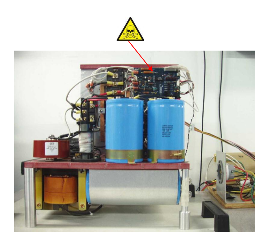
Figure 4 Power Supply – Left Side (Removed From Enclosure For Clarity)