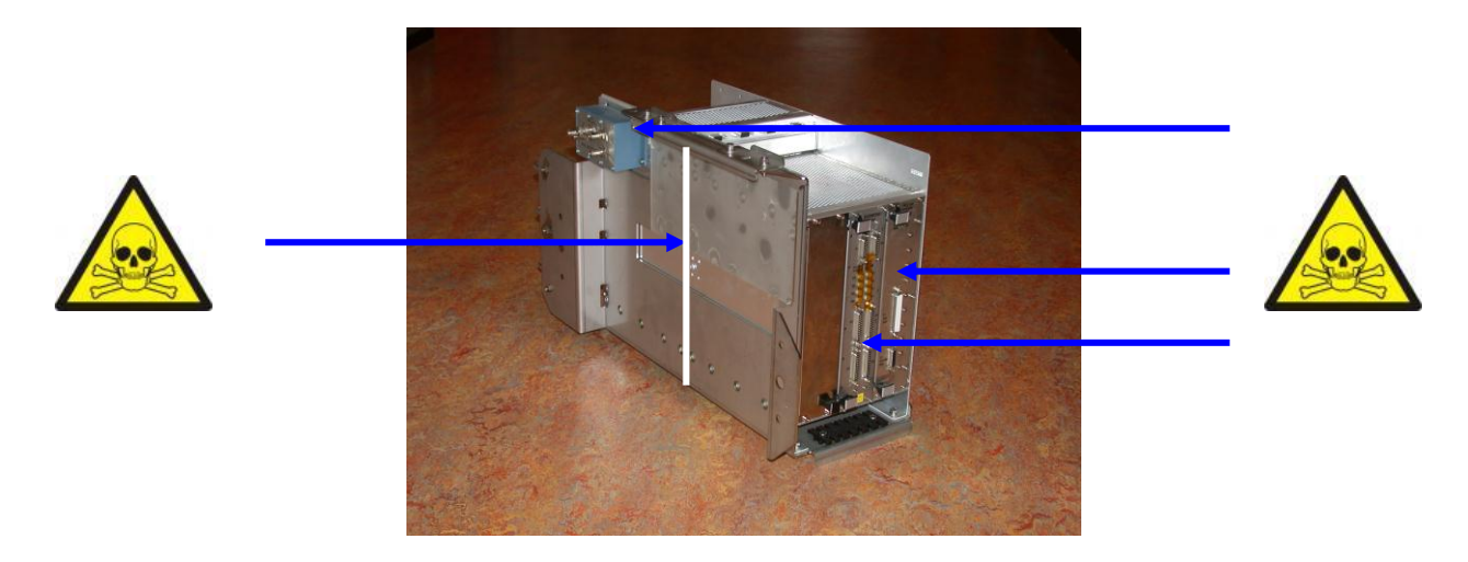
Figure 1a, PFEI-C-10T right-side