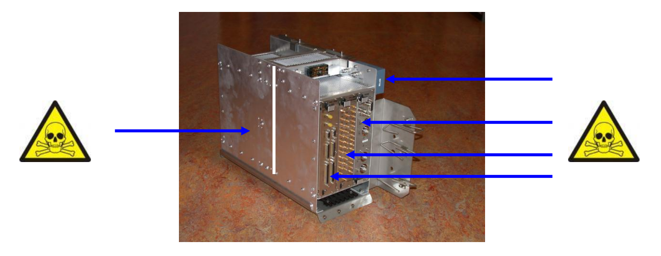
Figure 1b, PFEI-C-10T left-side