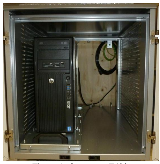
Figure 1 Computer Z420