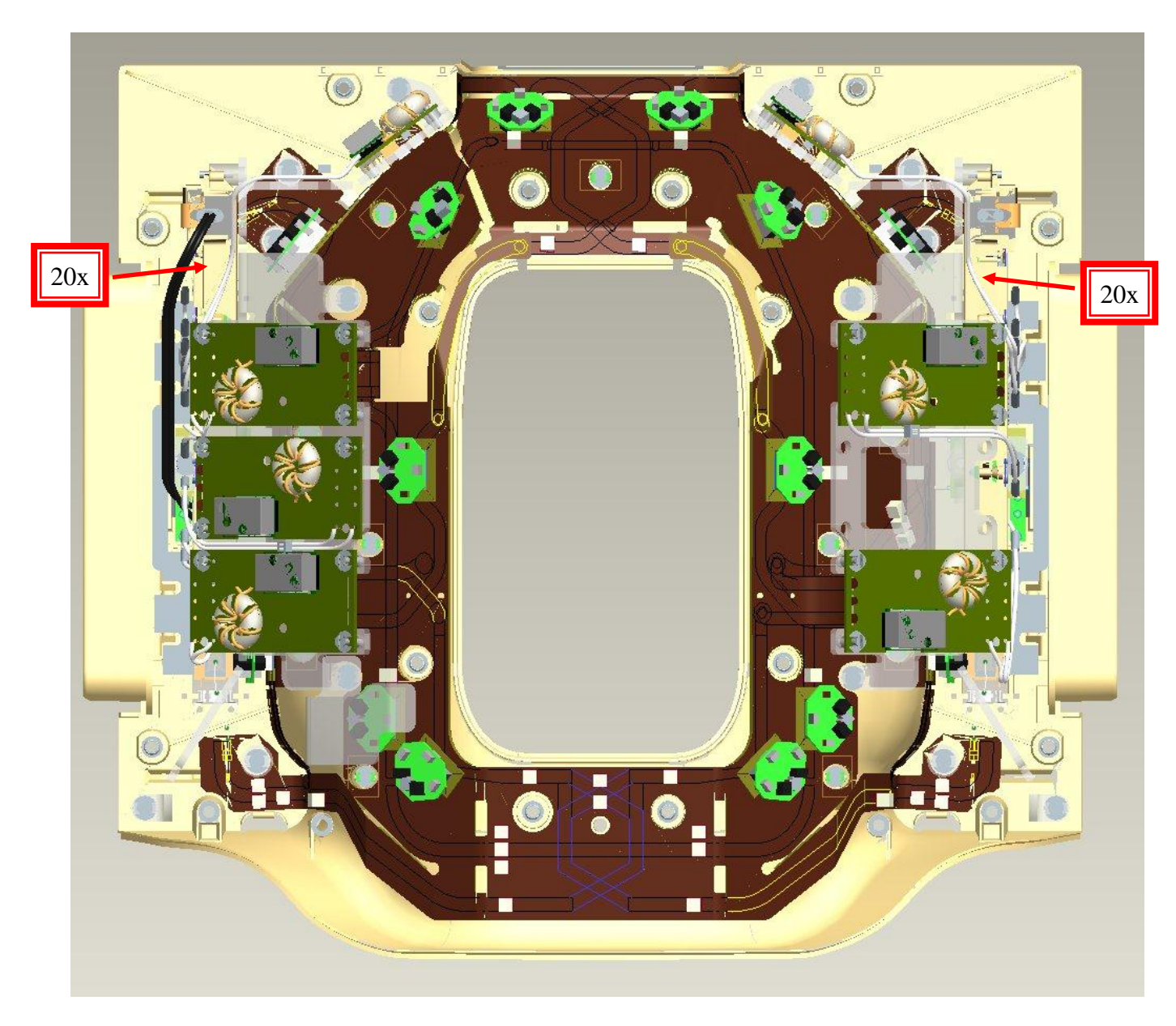
Figure 3, SMP Connector (multiple locations) in NVC Head 3.0T