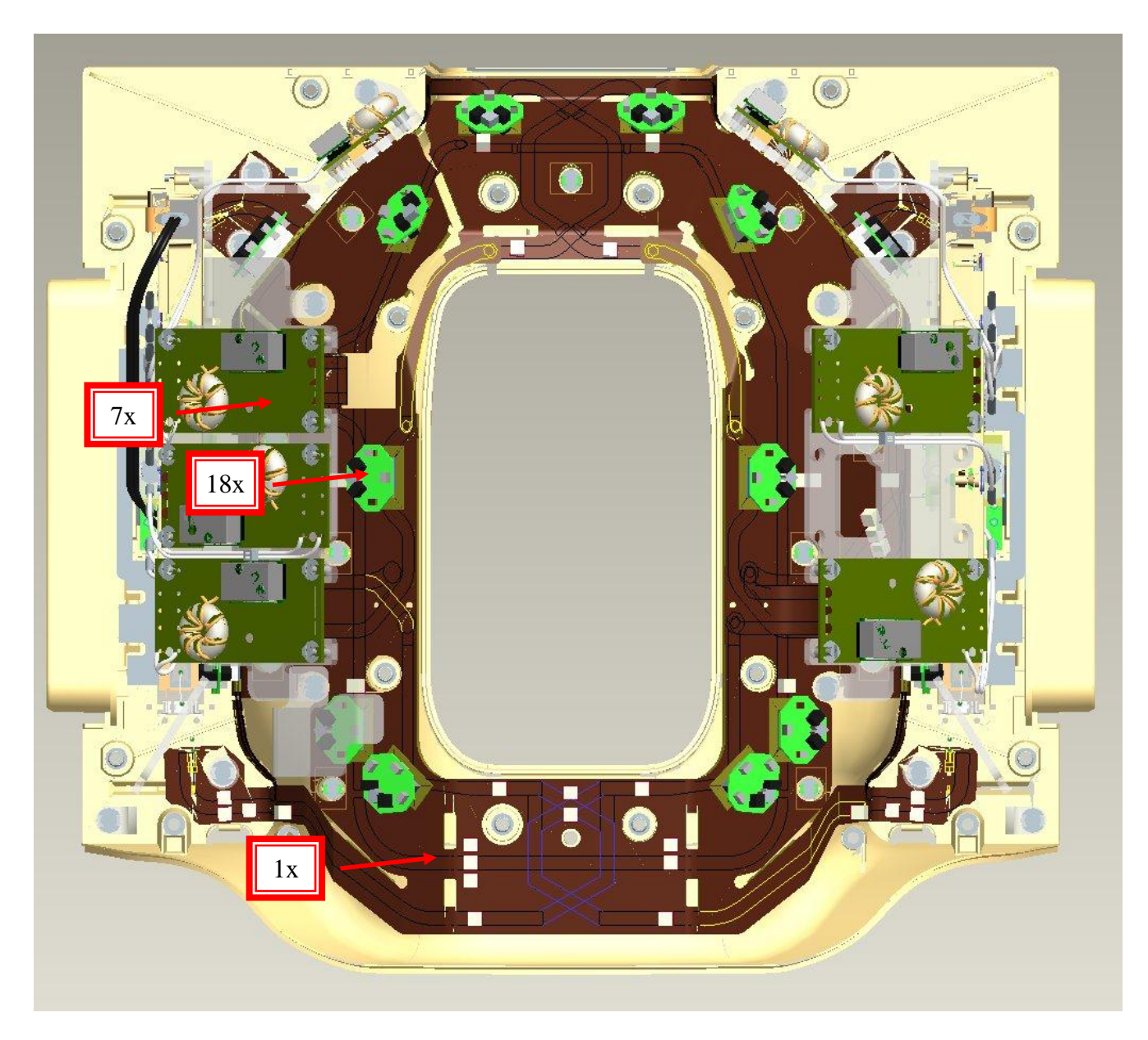
Figure 1, NVC Head 3.0T pcb locations