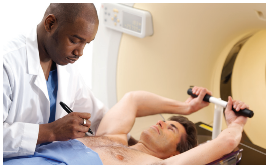
TruFlight Select PET/CT features a 70 cm CT extended field of view for oncology procedures.