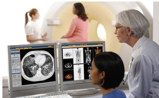
EBW NM provides an optional comprehensive portfolio of applications, providing PET, SPECT and CT on the same platform for improved access, connectivity, filming, and reporting.