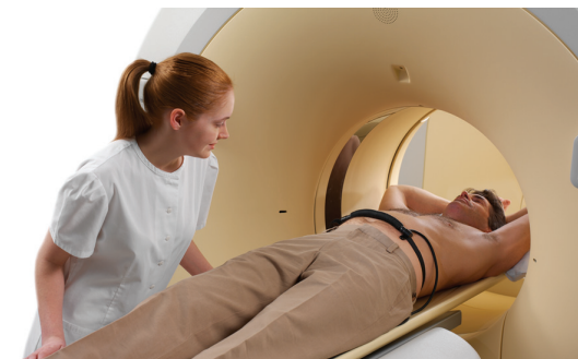
4D ToF offers prospective CT and PET gating as well as retrospective CT respiratory-correlated imaging to help manage patient motion for PET, CT, and interventional applications.