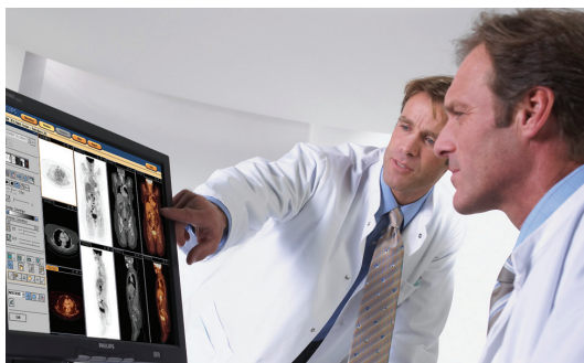
Fusion Viewer provides fused visualization of PET/CT studies.