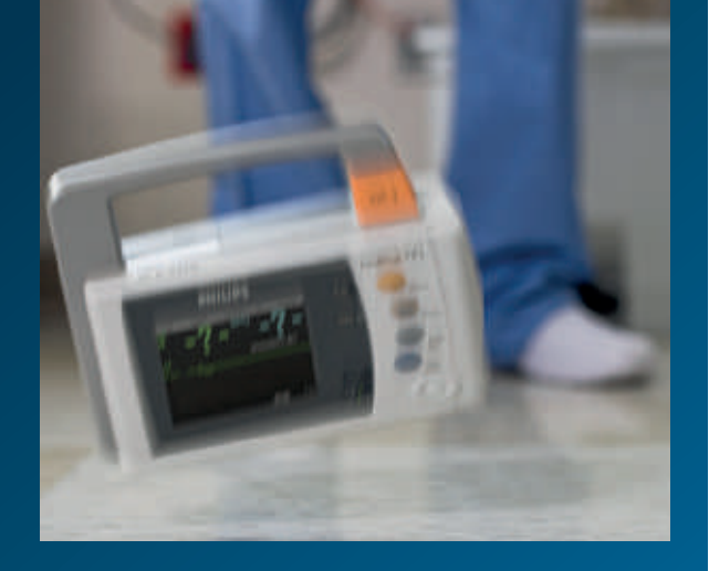
The MP2 is lightweight, yet rugged and is designed for reliable performance in demanding situations.