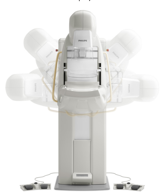
Figure 1: Philips MicroDose Mammography system.