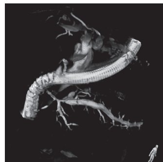
ERCP: 3D Pancreas