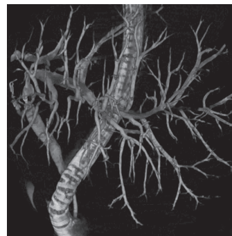
ERCP: 3D Biliary tree