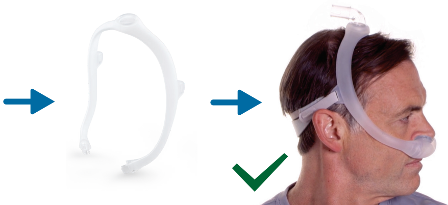
Medium correct frame

The medium mask frame will comfortably fit most faces. If the medium frame does not fit a patient's face, a small or large mask frame might better suit your patient's needs.