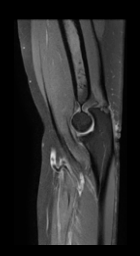
Sagittal PDw SPAIR 0.4 x 0.5 x 3.0 mm, 4:16 min Ingenia 1.5T