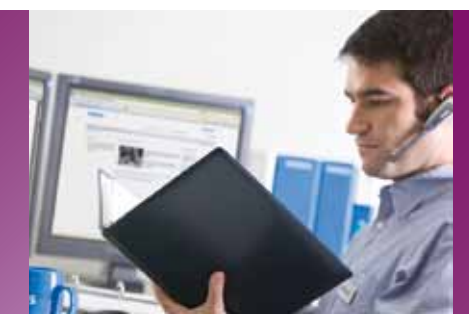
Service support, financing programs, and educational offerings give you peace of mind to get the most out of your system.

*Not all services available in all geographies; contact your Philips representative for more information. May require service contract. ** HD15