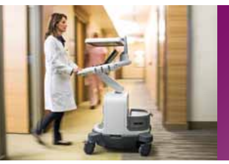
Philips Affiniti 50 features a tablet-like touchscreen and intelligently located, centralized controls, as well as an industry-leading, 54.6 cm fold-down monitor for easy mobility.