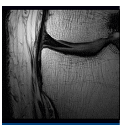
Coronal PDw TSE - Knee Resolution: 0.4 x 0.4 x 1.5 mm Scan time: 4:15 min Ingenia 3.0T

© 2015 Koninklijke Philips N.V. All rights reserved. Specifications are subject to change without notice. Trademarks are the property of Koninklijke Philips N.V. (Royal Philips) or their respective owners.