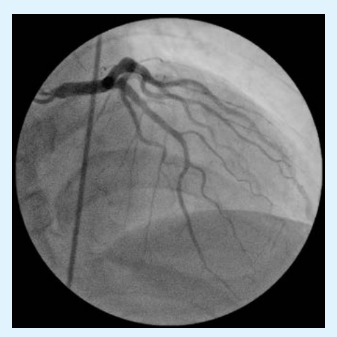
Left Anterior Descending

This product is not available in USA and Canada.