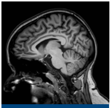
Sagittal 3D T1w FFE - Brain Resolution: 1.0 x 1.0 x 1.2 mm Scan time: 5:29 min Ingenia 3.0T