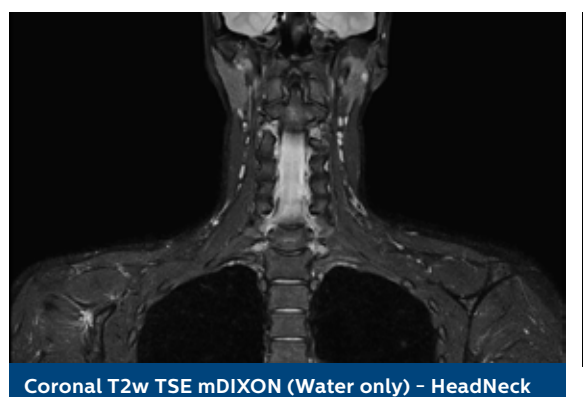
Sensitive 132 mb/kork (Mater Only) Treatment Scan time: 5:05 min Ingenia 1.5T