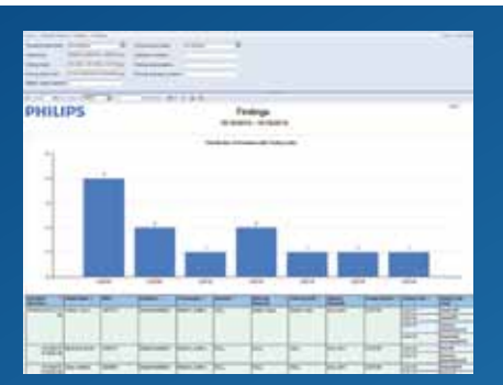
Examine data across your patient population for trending purposes.

Visit www.philips.com/IntelliSpaceCardiovascular. Or contact your Philips sales representative.