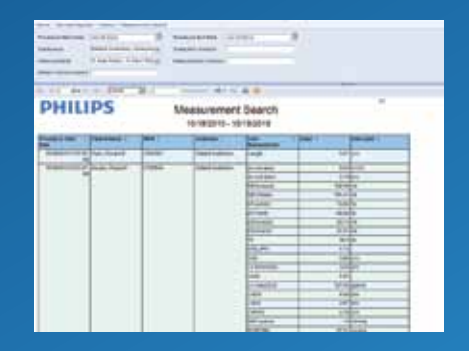
Uncover opportunities for enhancing procedural efficiency.

Microsoft, SQL Server, Internet Explorer, and Excel are registered trademarks of Microsoft Corporation in the United States and/or other countries.