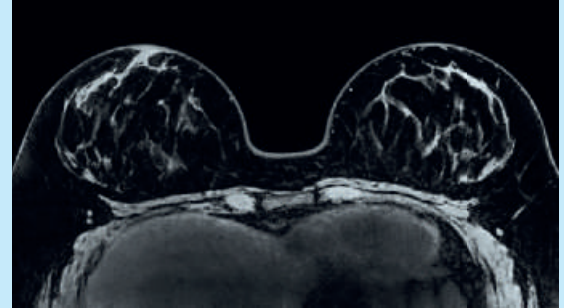
Axial T2w TSE