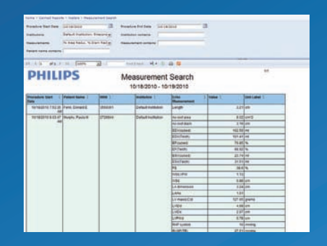
Uncover opportunities for enhancing procedural efficiency.

Microsoft, SQL Server, Internet Explorer, and Excel are registered trademarks of Microsoft Corporation in the United States and/or other countries.