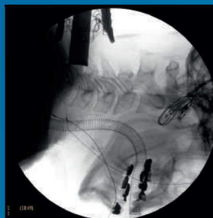
Disk Replacement Cervical Spine