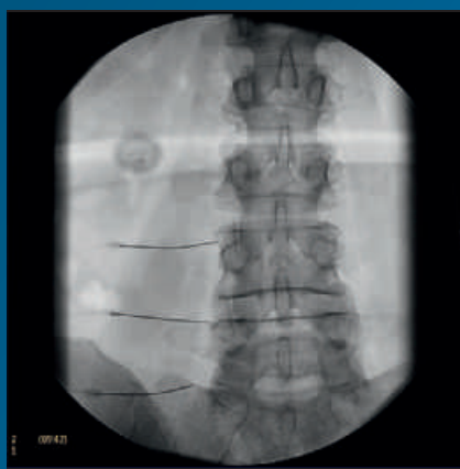
Pain management Lumbar Spine

“The surgeons are very happy with the image quality,” notes Brooks. They have good reason to be. Veradius Neo employs flat detector technology for undistorted, high contrast images to help visualize complex bone structure, device detail, and tortuous vasculature. First time right, high quality images speed decision-making and help reduce the need for repeat exposures.