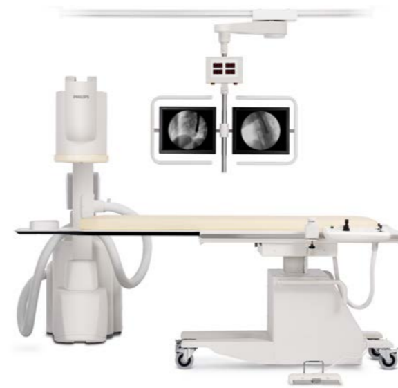
Allura FC with fixed C-arm stand

While you focus on patients and procedure you can bank on Philips world class service support to keep your system in best condition. Through service excellence, flexible solutions, and service programs, Philips gives you peace of mind by ensuring that your system runs in peak performance – today and in the future.