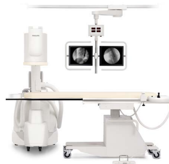
Allura FC with movable C-arm stand