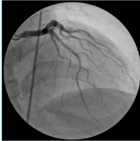
Left Anterior Descending

This product is not available in USA and Canada.