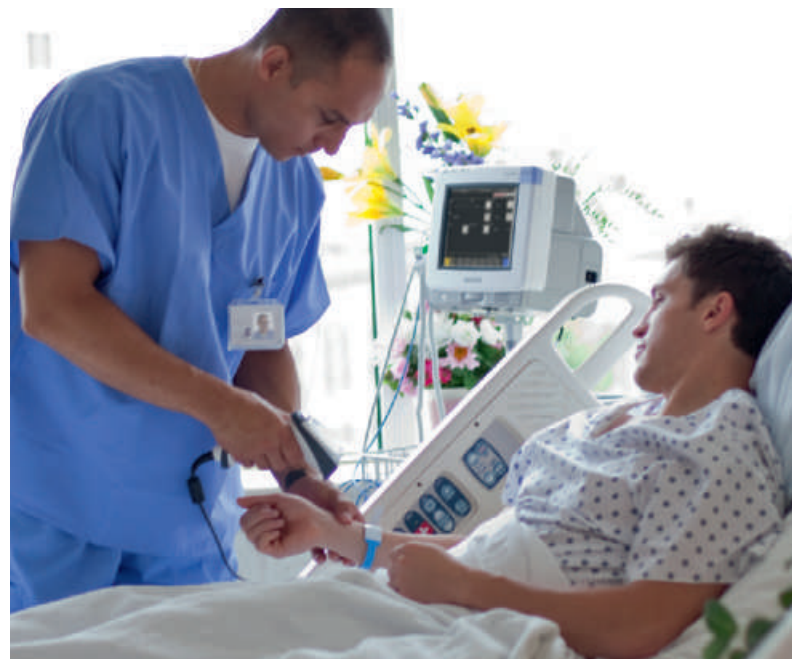
The MP5SC with IntelliVue Guardian EWS helps caregivers on the general floor take vital signs and quickly calculate Early Warning Scores.