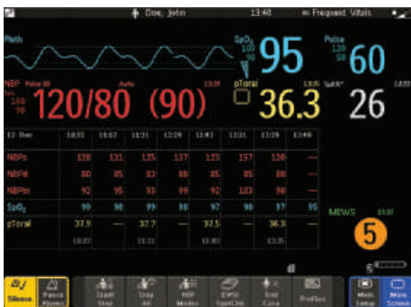
Exceptional IntelliVue measurement accuracy and trending capability.

PG Dip Echo Director of Intensive Care Research, Staff Specialist in Intensive Care Department of Intensive Care Austin Hospital, Heidelberg, Vic. 3084 Australia