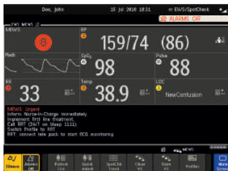
Hospitals have the ability to take an existing escalation protocol and automate it in a spot-check monitor.