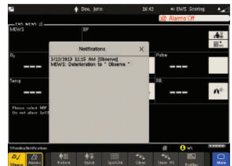
Centralized EWS workflow and notification via IntelliVue Guardian Solution.