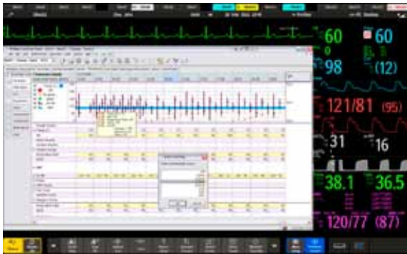
Show patient flow sheet from critical care information system (Philips ICIP).