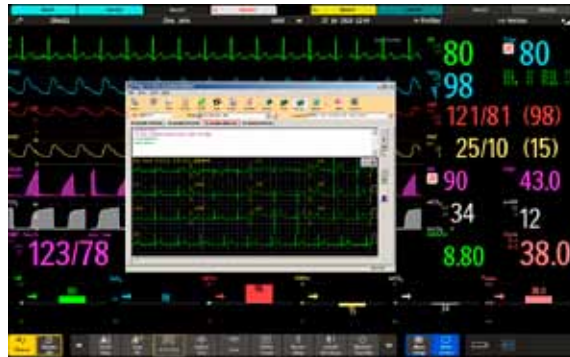
Access previous ECGs from Philips TraceMasterVue or other ECG management systems.