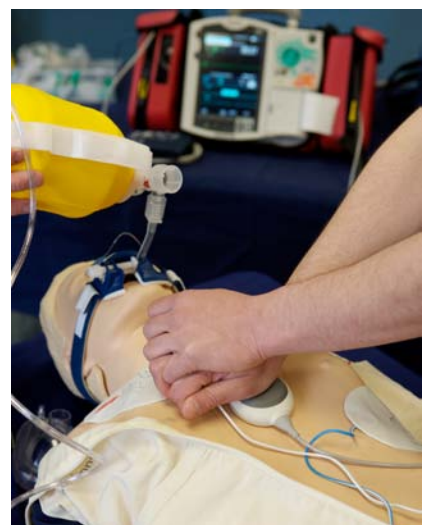
Philips Q-CPR helps guide trained responders giving CPR.