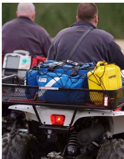
All-Terrain Vehicles operated by Bensalem EMS are equipped with defibrillators.

All ambulances, police cars, and fire marshal vehicles; fire trucks; city municipal offices; athletic fields; schools; private businesses; Commerce Bank Amphitheater; Philadelphia Park Casino and Racetrack.