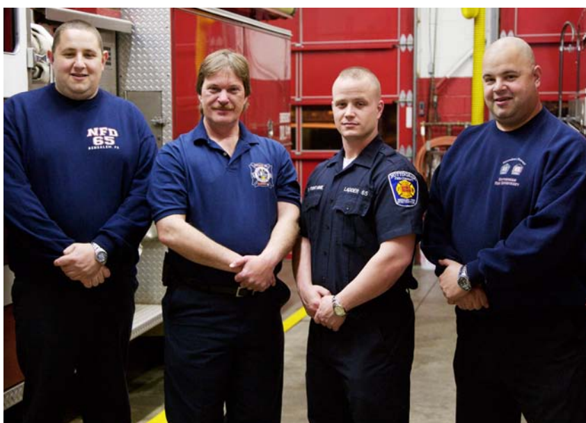
Members of the Nottingham Fire Company.