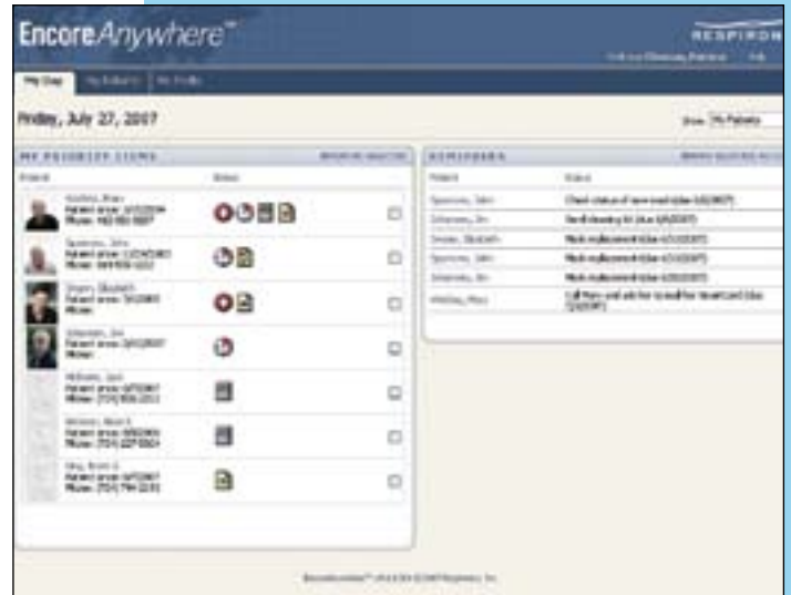
User profiles determine icon notification availability on the My Day page.

The My Day page is a user's first stop to review patient treatment status.