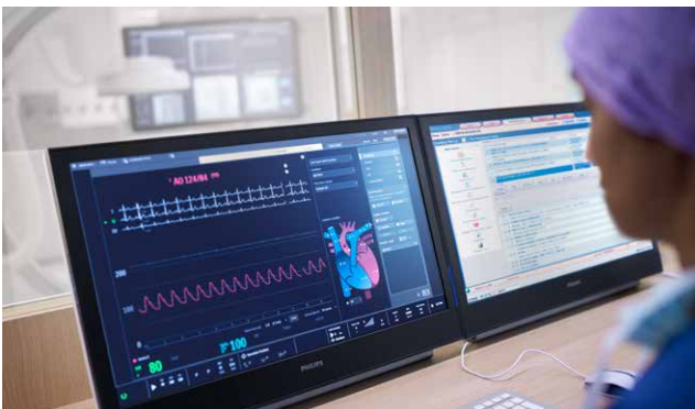
Graphical interaction and user guidance through the procedure