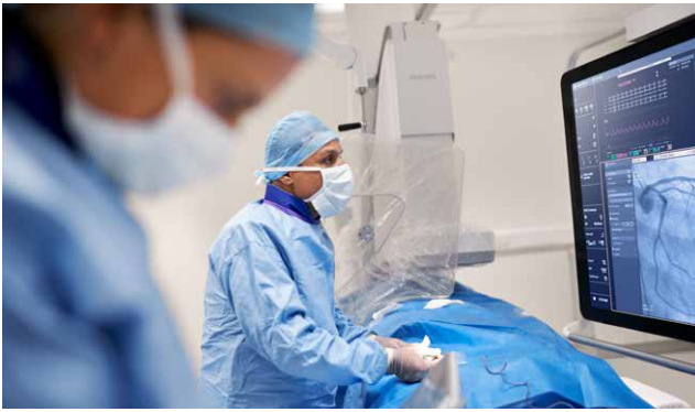
Hemodynamic analyses performed in the control room can be shown in the exam room to help the users to stay focused on the task at hand.