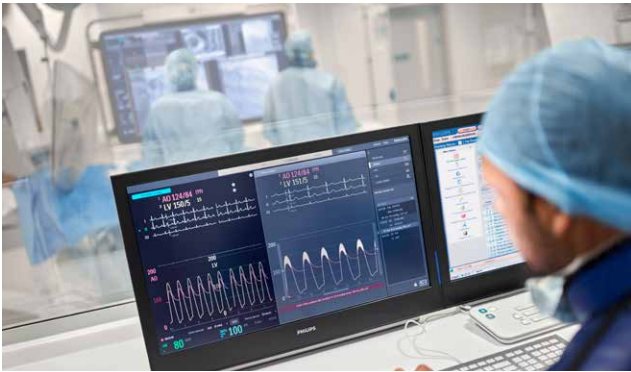
Improved communication between control room and exam room