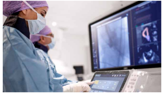
Control of Philips Hemo on Touch Screen Module