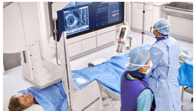
Confidently used by all staff members with minimal training