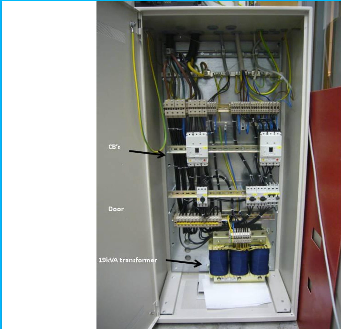
Figure 1 gMDU 400V-60Hz; 9896 030 2014.x

The cabinet of the 9896 030 1995.x (gMDU 400V-50Hz) and 9896 030 2014.x (gMDU 480V 60 Hz) are similar except for the 19 kVA transformer.